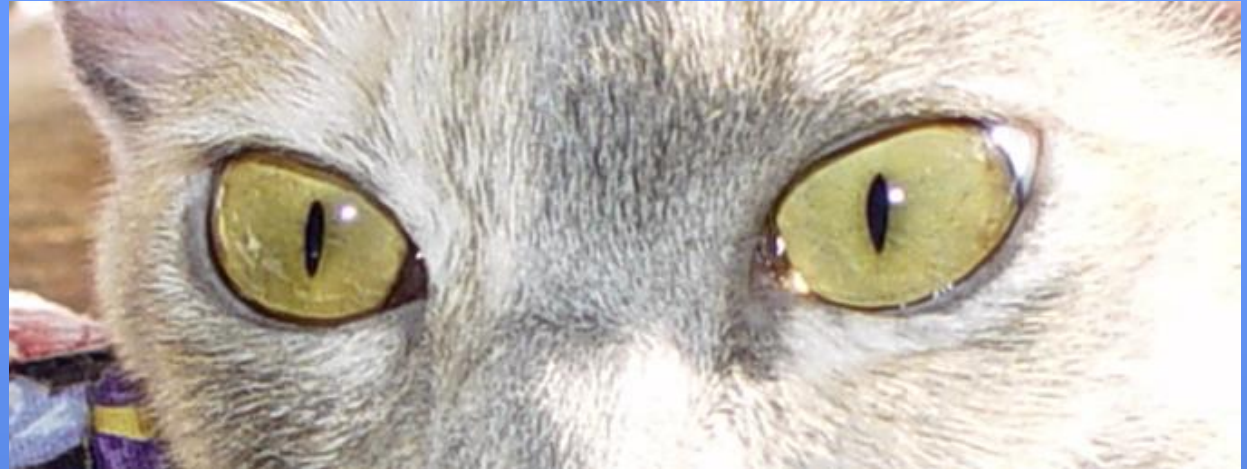
A little bit more alert but okay eye shape