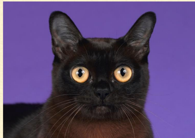
Excellent Brilliant Gold