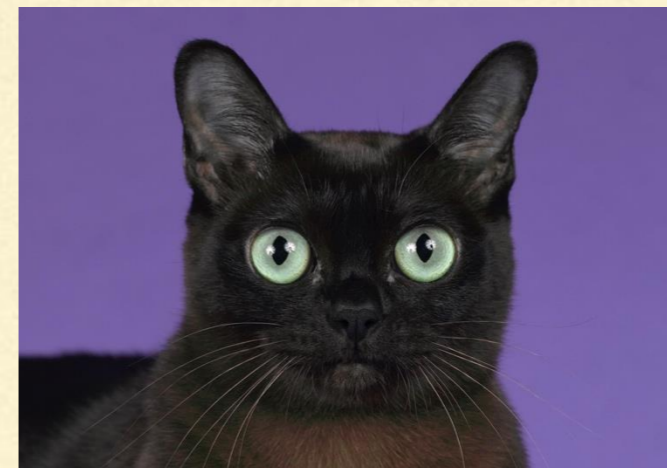
Green - Penalize