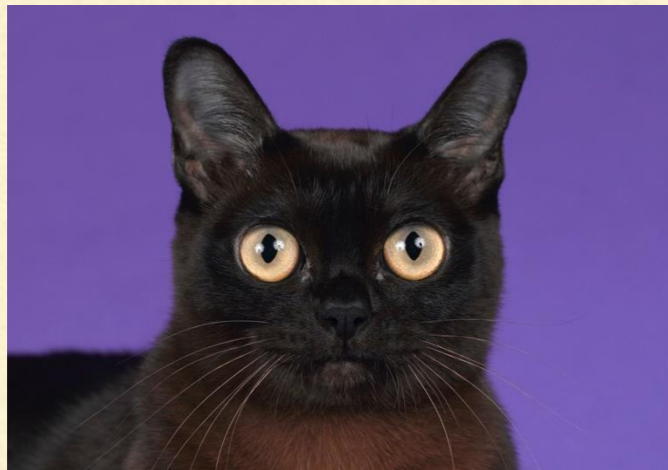
Good Brilliant Yellow