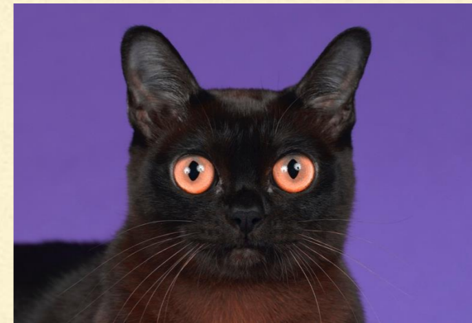
Acceptable Near Copper